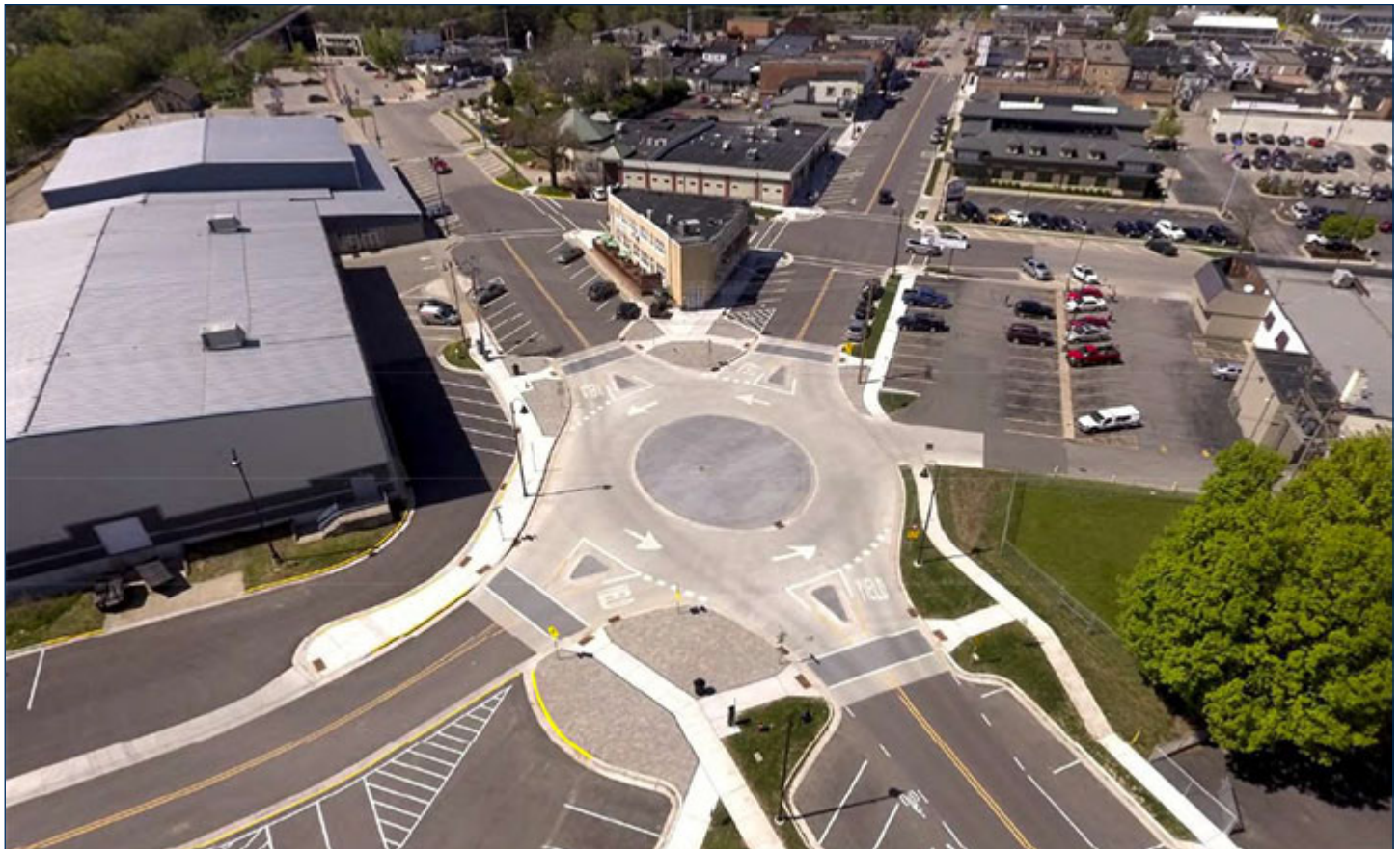
Aerial view of completed intersection improvements Superior Street and LaCrosse Street, Wisconsin Dells.