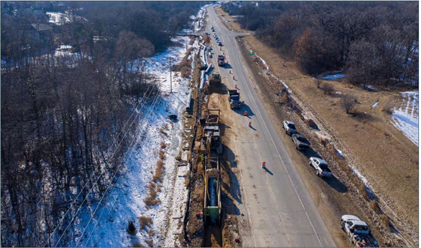
Construction staging for water main installation, Racine Water Utility, Mount Pleasant.