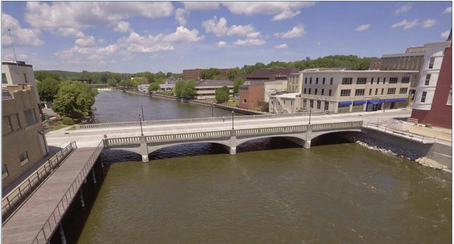
Completed bridge over the Rock River, Janesville.