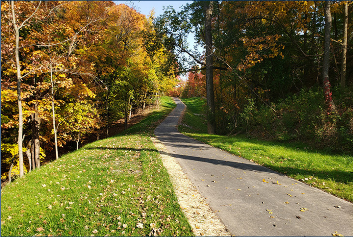
North-South portion of Hidden Lake Trail, Brookfield.