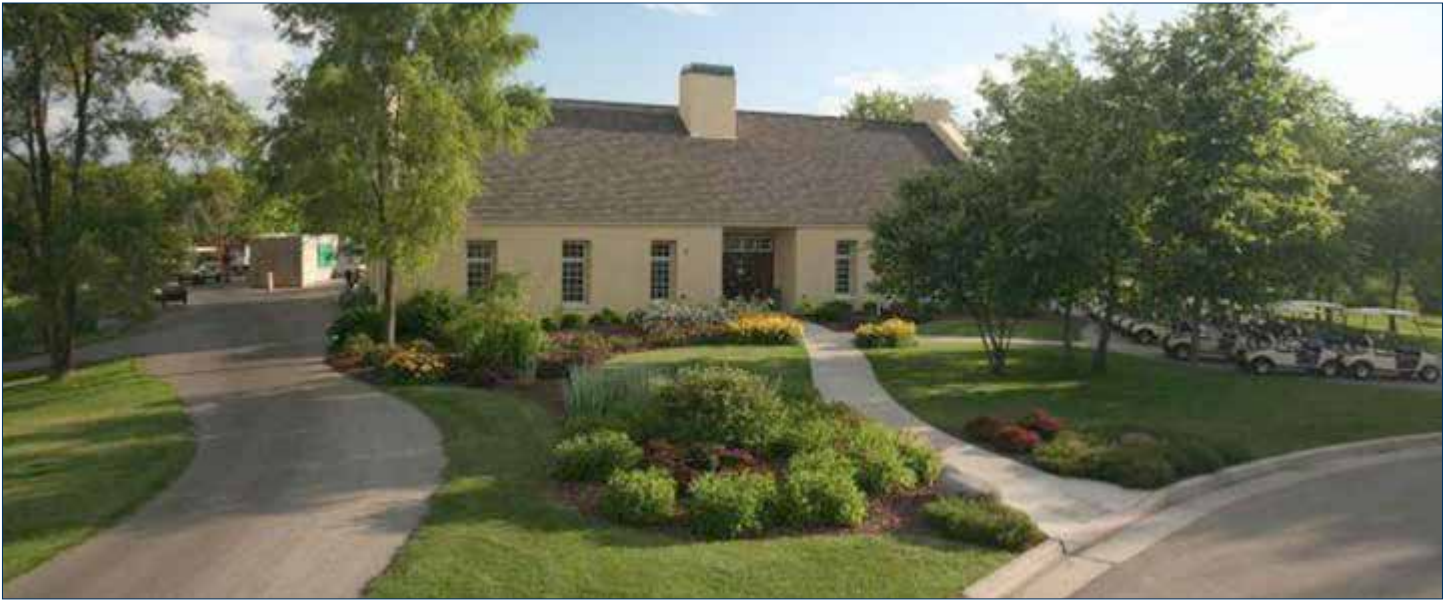
The Glen Erin Golf Course Clubhouse.

cart, lunch, giveaways, and inclusion in the prize drawings. Please note that proper golf attire is required to participate in this event. Please, no jeans, t-shirts, jean shorts, cut-off shorts or oversized cargo shorts. Shotgun starts at 9:00 a.m.