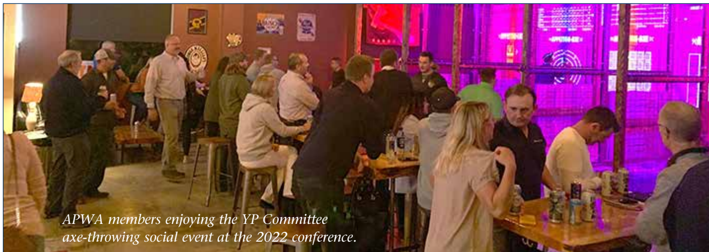
APWA members enjoying the YP Committee axe-throwing social event at the 2022 conference.