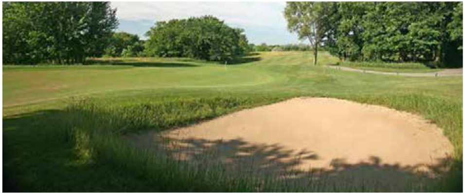
The Glen Erin Golf Club is located just south of Janesville on Airport Road. Visit the website at https://gleneringolf.com/contact for directions.