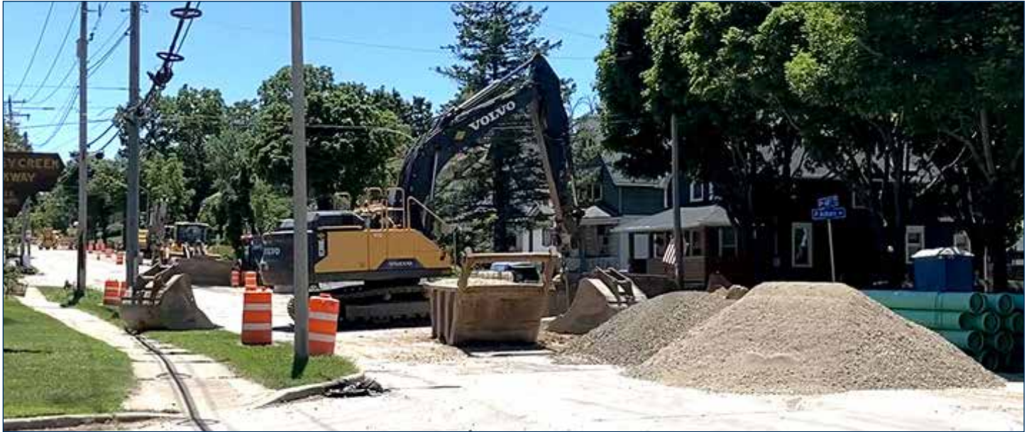
Summer road construction project on 68th Street in Wauwatosa.