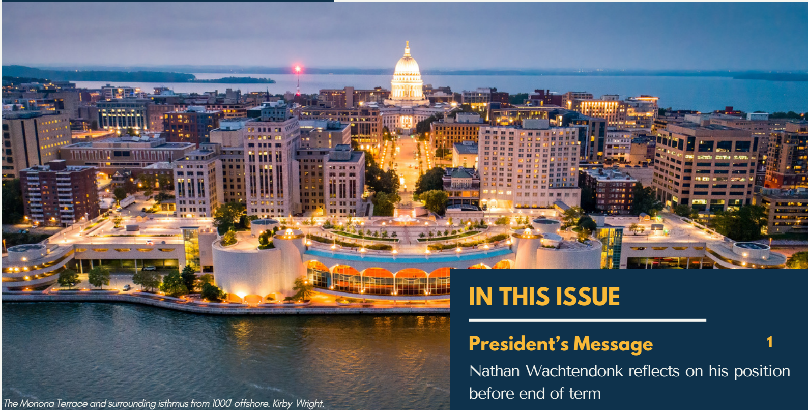
The Monona Terrace and surrounding isthmus from 1000' offshore. Kirby Wright.