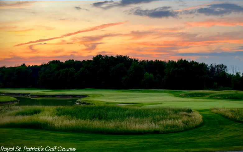
Royal St. Patrick's Golf Course

If you can't attend this year's summer outing, you can still donate to the scholarship fund using the "Donation" option on the registration page .