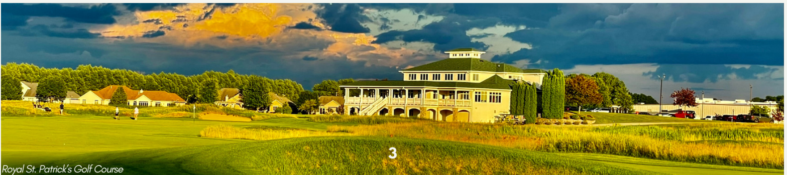
Royal St. Patrick's Golf Course

We will also be bringing back some great training for this year's event, including Winter Road maintenance training, as well as mechanical training intended for mechanics and technicians. continued on page 4