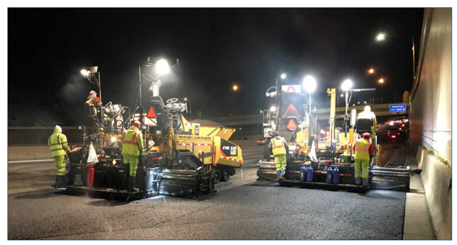
Reduced traffic volumes and full system lane closures allowed for an increased workforce to double the number of peak production hours each night, completely eliminating the need for unnecessary transverse cold joints.