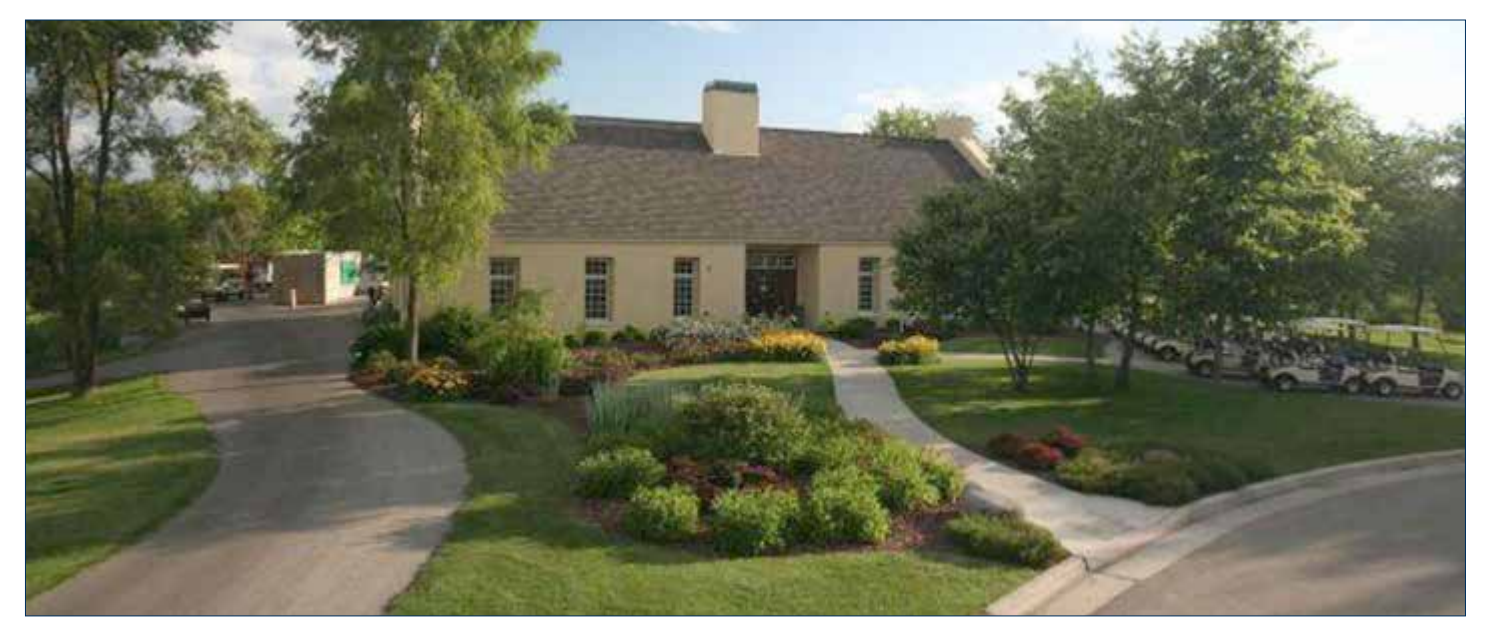
The Glen Erin Golf Course Clubhouse.