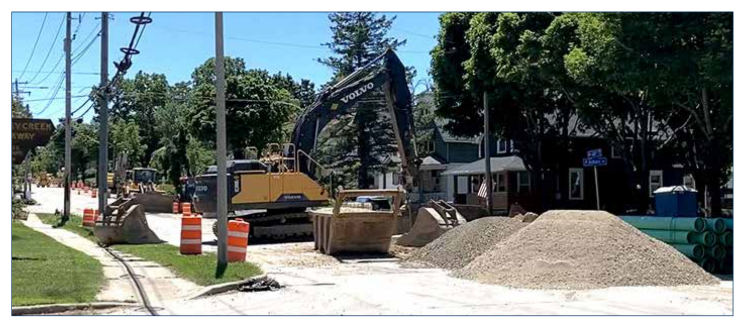
Summer road construction project on 68th Street in Wauwatosa.