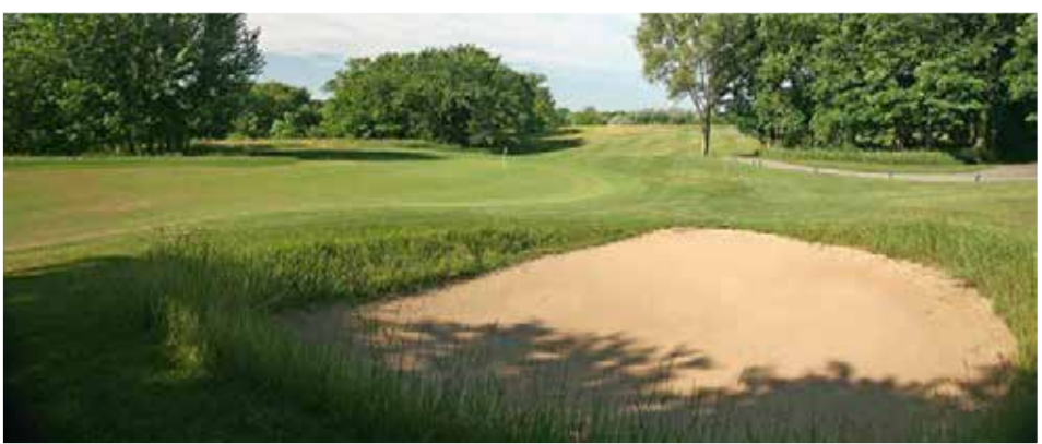
The Glen Erin Golf Club is located just south of Janesville on Airport Road. Visit the website at <u>https://gleneringolf.com/contact</u> for directions.

Summer Outing | Snowplow Roadeo | WI Highway Funding | PWSA/PWMI Classes | PWMI Grac GLEN ERIN