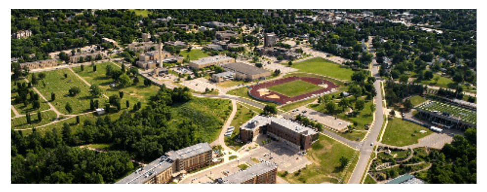
The UW-Platteville campus is the site for the Fall Conference.