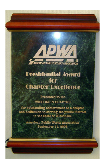
The PACE Award as it appeared in 2006, the first year the Wisconsin Chapter won the award.

Congratulations to all of you for making the Wisconsin Chapter a 17-year winner of this prestigious award. ∠