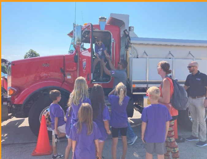
Kids taking turns getting to sit in one of DePere's snow plows.