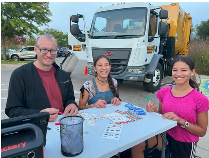
Verona residents brainstorming names for the new Leaf trucks

collection and encouraged to rake leaves out of the street if they can do so safely.